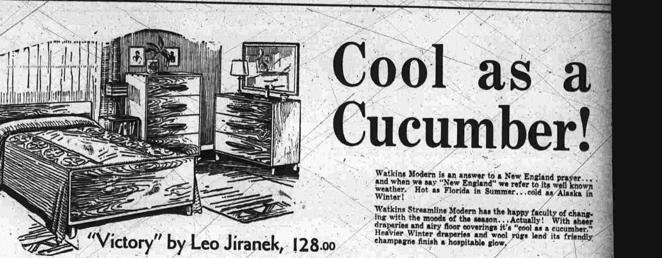
"Victory" by Leo Jiranek, 128.00... The "Victory" Bedroom above was designed by Leo Jiranek, famous Modern artist of New York.