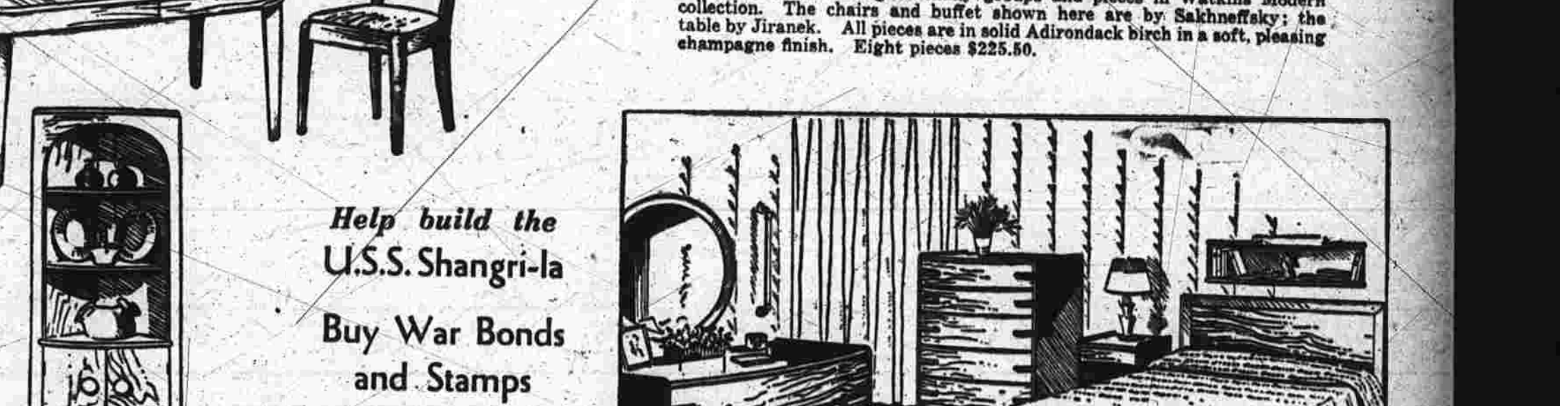
The "Calitan" Bedroom 125.00... Three pieces in solid maple in a finish slightly lighter than "Colon" color.